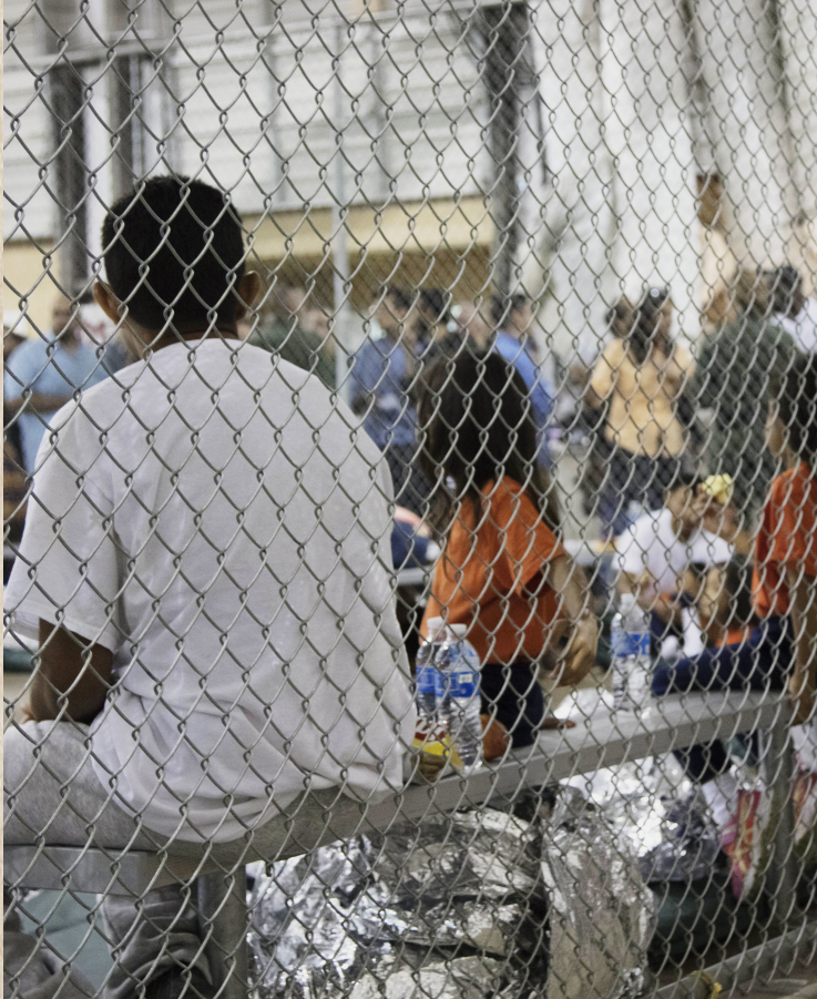
Photographed by U.S. Customs facility in McAllen, Texas, on Sunday. ( https://www.npr.org )